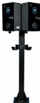
Base M & Back 2xOD

Possibility of mounting the charging station on a pedestal aluminum base on the floor.